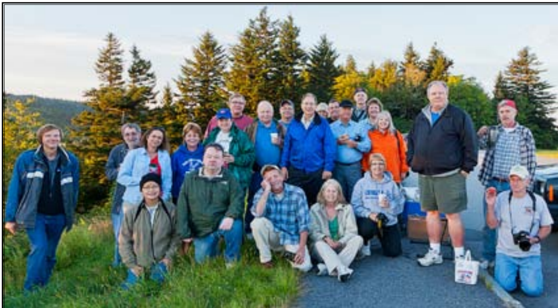
CCC at Blue Ridge Parkway—2012